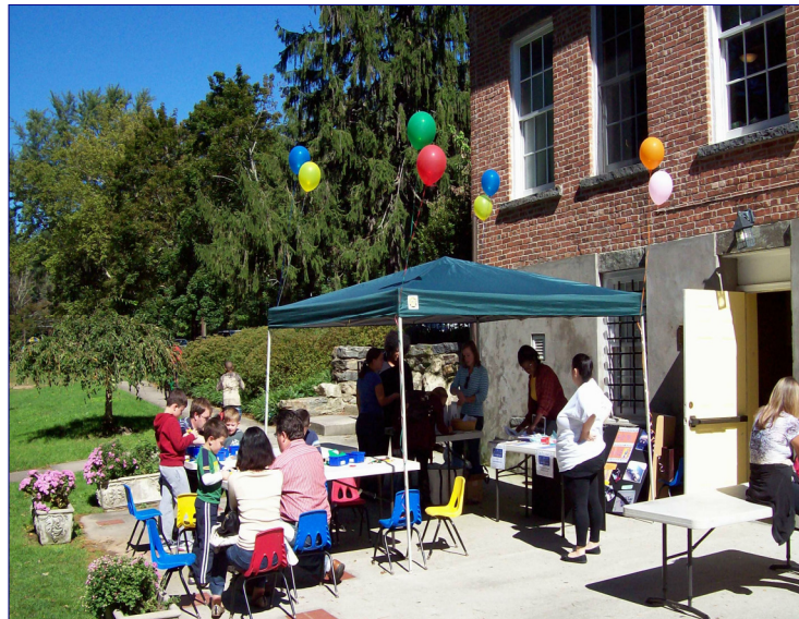
Children and caregivers enjoy arts and crafts activities on the patio as part of Old Fashioned Summer Fun at the Huguenot Children's Library last summer.